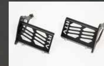
Tail lamp guard