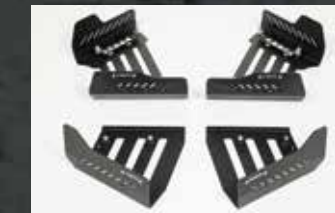
A-arm guard (Front / Rear)