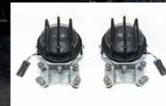
Front work light