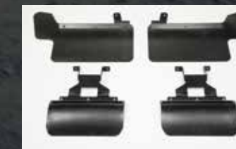
Mud guard (Front / Rear)