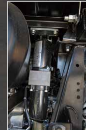
Electric hydraulic bed lift kit (left: dump switch / right: lift cylinder)