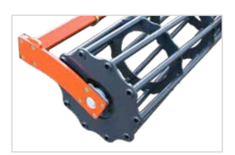
Cage roller ø 550mm - 90 kg/m 10 bars ensure a good loading capacity and effective crumbling actions even in wet conditions.

Actiflex ø 580mm - 160 kg/m The Actiflex roller has been made to create an intensive mixing and create a nice seedbed with all soil types, even stony conditions. The rings made with spring steel are separated by skids to have a high resistance against stress at high speed and enhance weeds regrowth after harvesting.