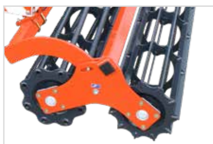
Double cage roller ø 400mm (tube/flat) - 160 kg/m

The double cage roller ensures a good crumbling and levelling effect. It has a high carrying capacity and it is used for precise depth control.